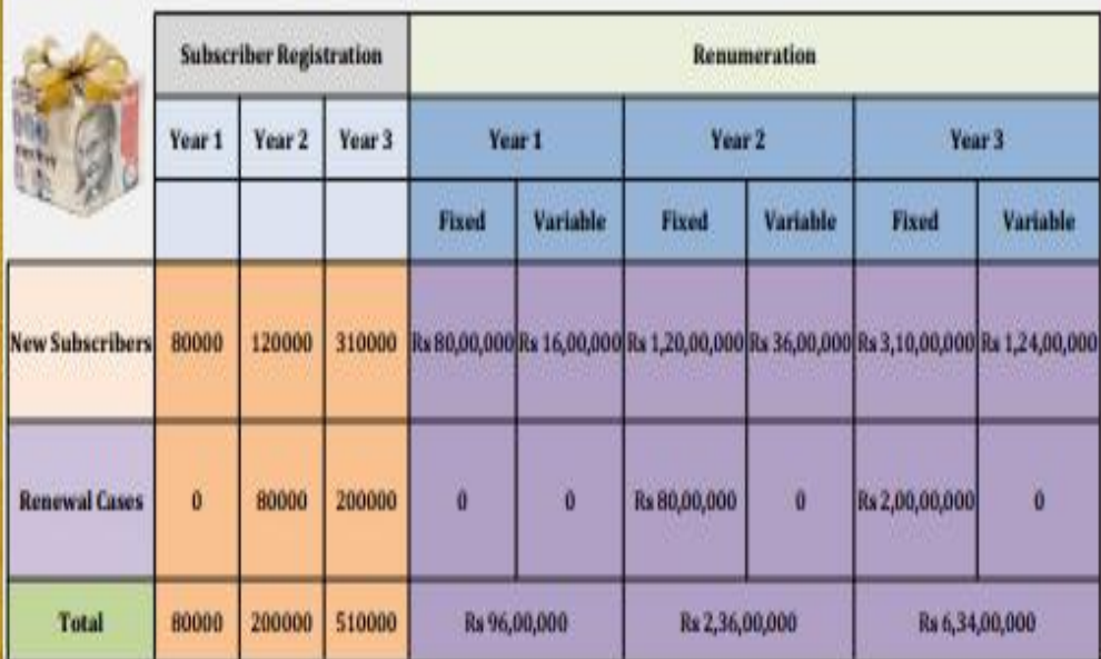
Illustration on Revenue Structure

Note: Only for Swavalamban eligible accounts.